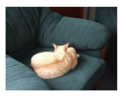
Casper - The House Management